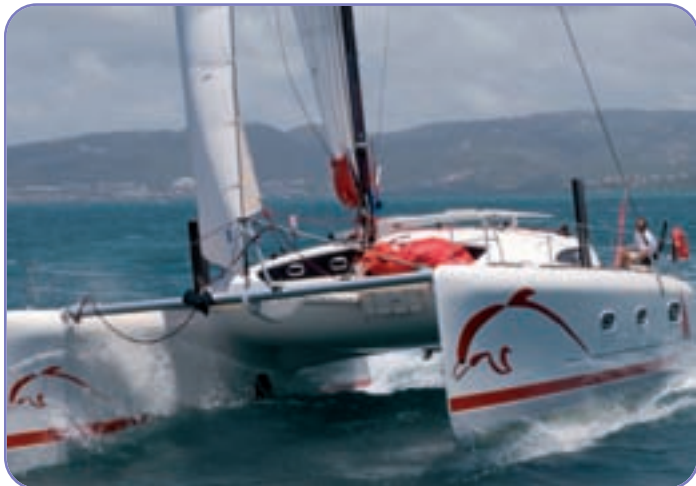
This 50-footer's 'plus'? The way it slips through the water!

And what first impressions! Real pleasure... After the traditional photos, we embarked aboard the TS to go for a sail. The conditions were windy: a steady 20 knots, with gusts of up to 28. As for the sea conditions in the Saint Lucia channel, they were rough, with waves of up to 2.5m and a very disorganised sea. Wedged into the bucket seat, worthy of a sea-going formula 1,